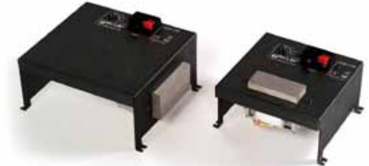
IC6PLUSTR and IC8PLUSTR optional transformers