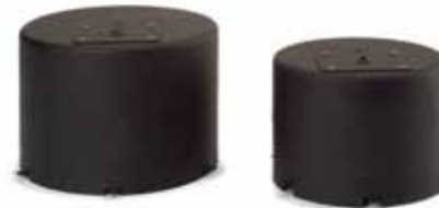
IC6PLUSBCAN and IC8PLUSBCAN optional back cans